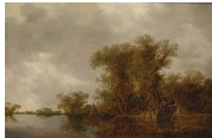
Jan van Goyen River Scene, 1634 oil on panel